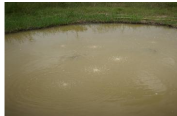
Fig.2. Site test and installation process of Wastewater treatment pond